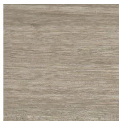
NATURAL TEAK (AT 1 YEAR)