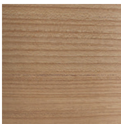
NATURAL TEAK (NEW)

We strongly recommend using our custom-fit outdoor covers to protect furniture from the elements and minimize aging.