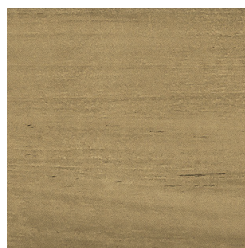
NATURAL TEAK (AT 6 MONTHS)