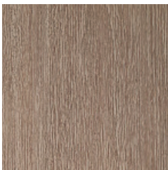
WEATHERED TEAK FINISH (NEW)

We strongly recommend using our custom-fit outdoor covers to protect furniture from the elements and minimize aging.